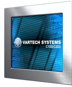
Available in stainless steel

DiamondVue hazardous area monitors and computers are NEMA 4X (IP66) protected from dirt and moisture at the front bezel, and incapable of causing ignition of flammable gas, vapors, or dust under normal working conditions in hazardous area environments.